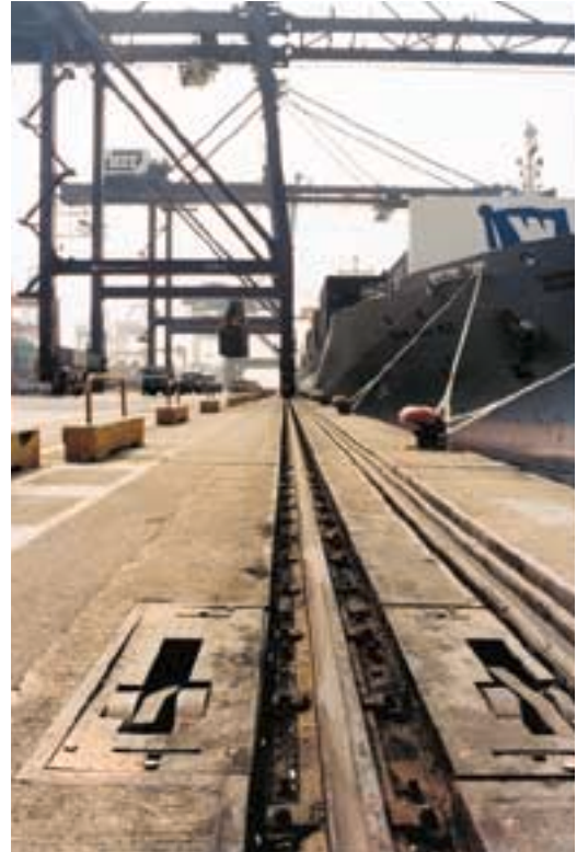
HIT (Hong Kong) - Weldable clips