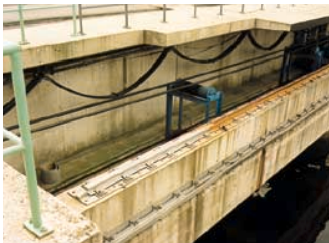
Sea-lock Zeebrugge (B) - Boltable clips

Designed as stress resistant, their mechanical performances have been certified by demanding and highly specified tests carried out by the Evaluation Laboratory for Rail Tracks Construction in München (Germany).