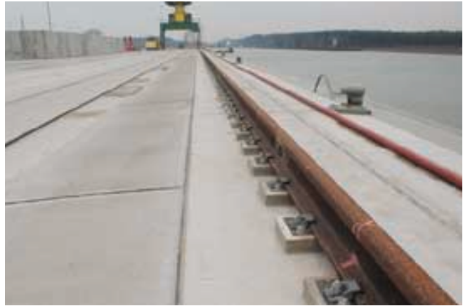
Landside port Eberswalde (D) – Boltable clips