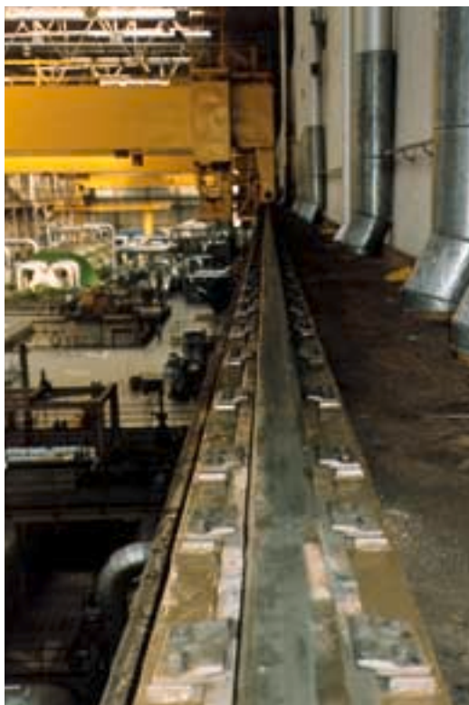
Nuclear Power Station Tricastin (F) - Weldable clips