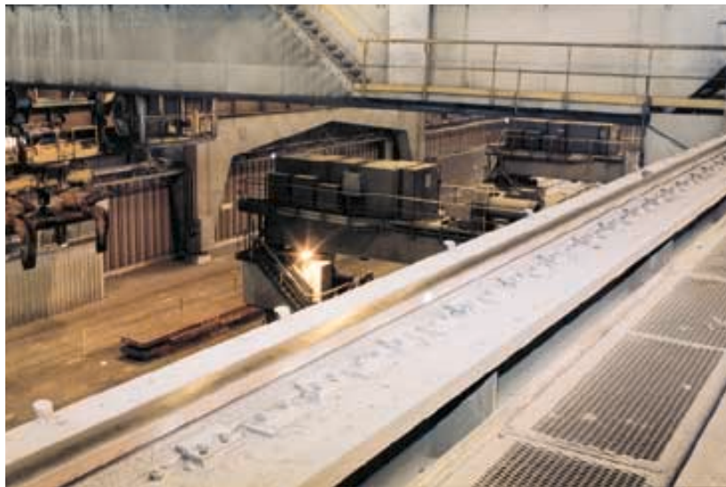
Sollac Dunkerque (F) - Weldable clips